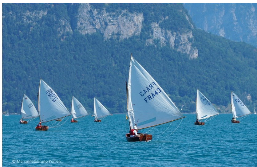
2020 edition of this regatta