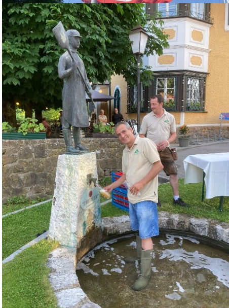
the beer fountain.