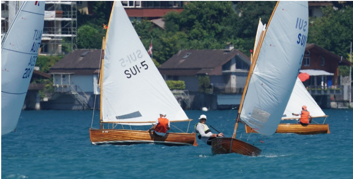
A scene from last years event

One of our favourite regattas, entries are now open (via the Manage2Sail system) for Thun Yacht Club's Segelwoche event on July 15 – 16.