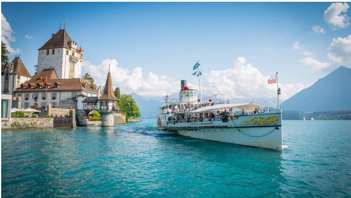
Oberhofen Castle on Lake Thun. Why not put your boat in this picture?